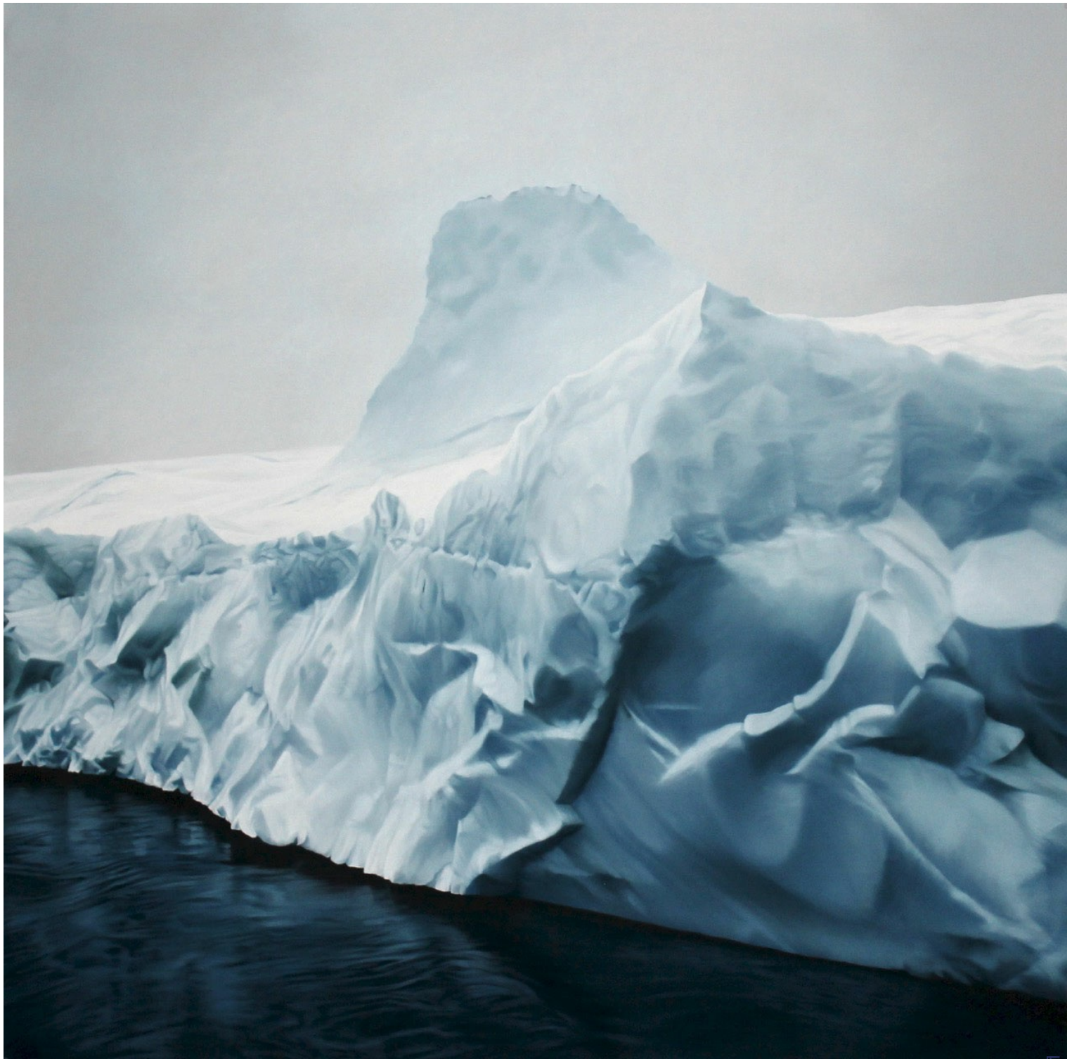
DRAWING BY ZARIA FORMAN

RACHEL LINK: Can you tell me a little bit about your mother?