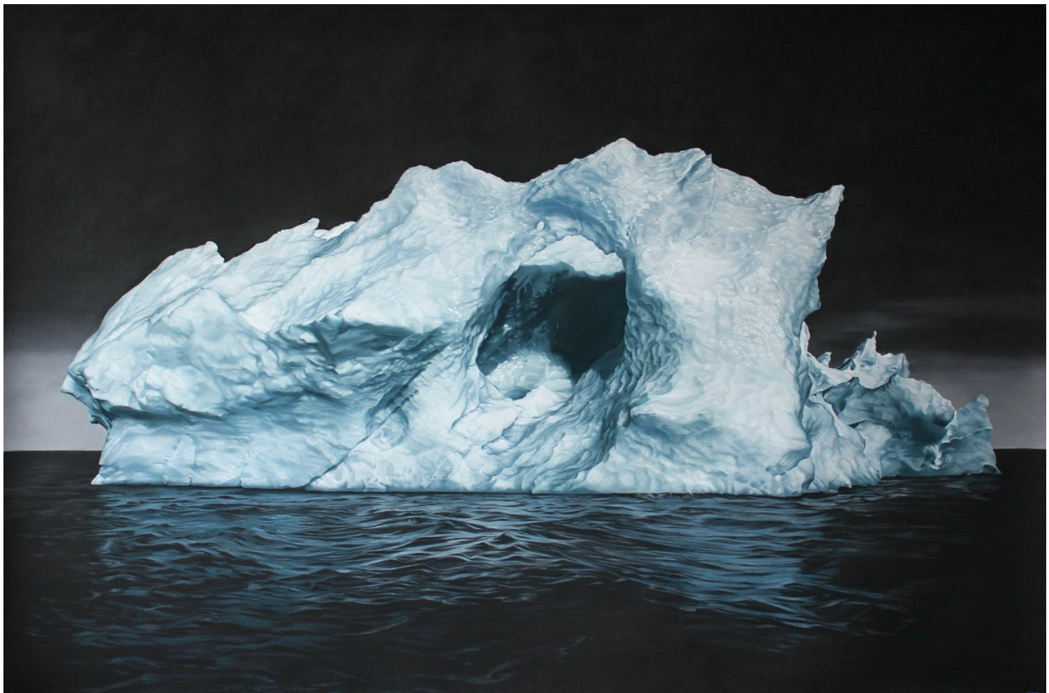
DRAWING BY ZARIA FORMAN

RACHEL: Could you explain your artistic process?